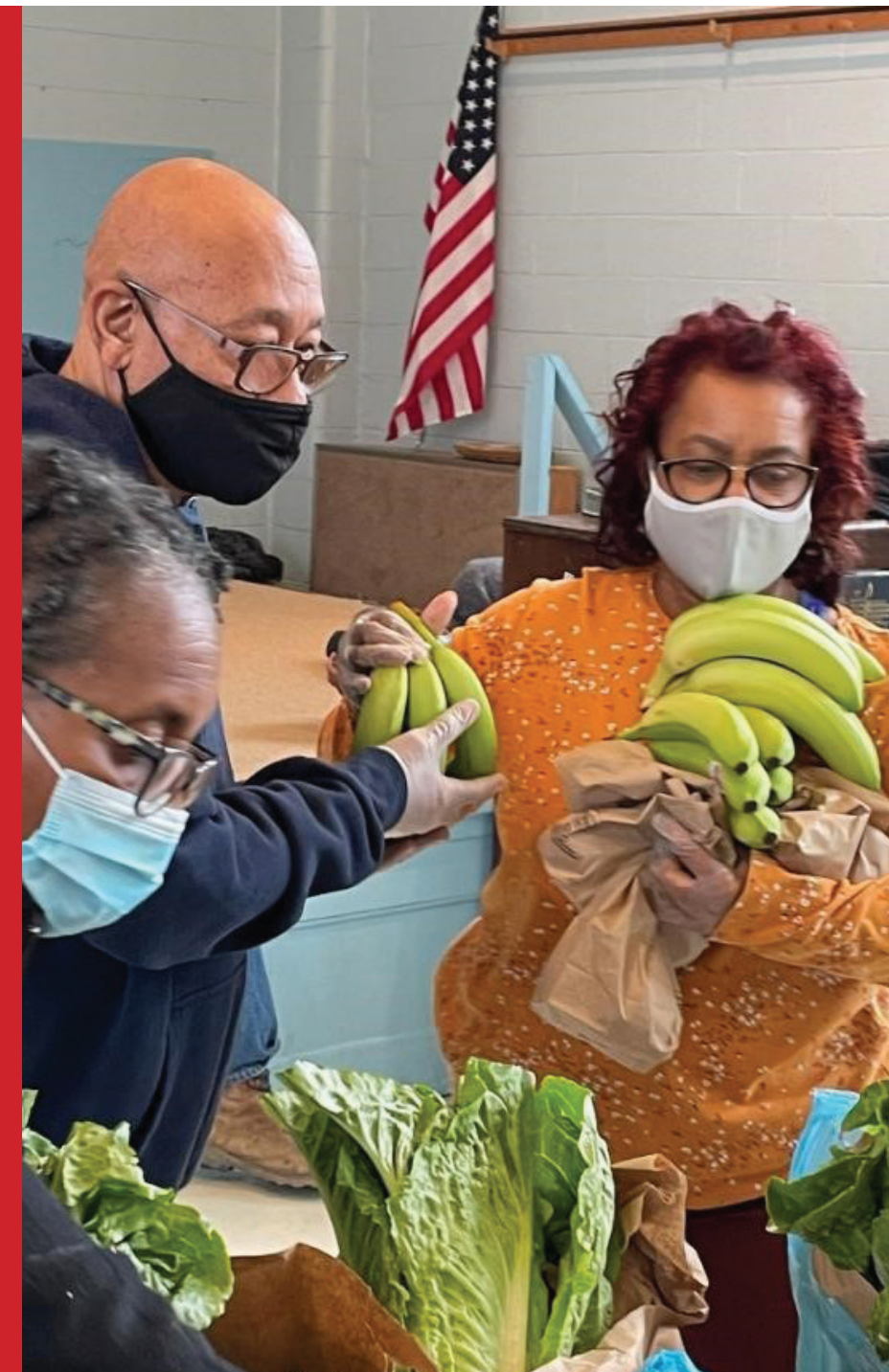
Pittsburgh volunteers help provide fresh fruits and vegetables to individuals and families in economically disadvantaged neighborhoods. Thanks to the generosity of an anonymous 1924 Circle Cor Vitae Society member, and in collaboration with local community organizations, the AHA introduced 45 Pop-Up Produce Markets in January 2021 to the Greater Pittsburgh region.

Contributions to the campaign will support educating key decision makers, coalition and partner engagement, as well as public education and strategic education.