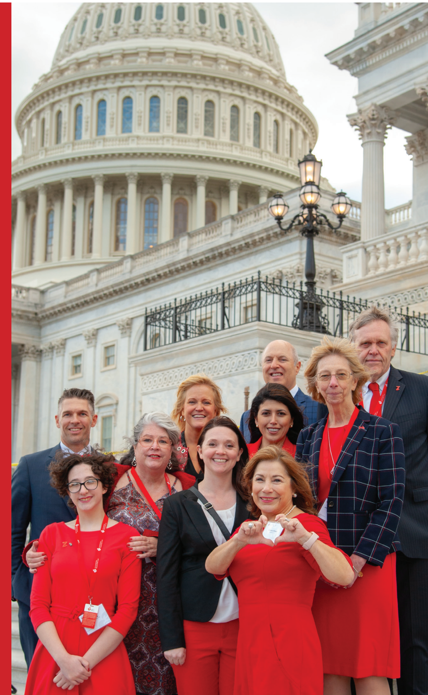
Volunteers gather at the Capitol for You're the Cure on the Hill , where they asked members of Congress to support policies that will lead to longer, healthier lives.

The American Heart Association believes every child, every family, every individual should have access to quality affordable health care and shouldn't face financial ruin if they need care. We also believe that too many people have been shut out due to cost, coverage or color. We are doing all we can to ensure quality affordable care is available to all.