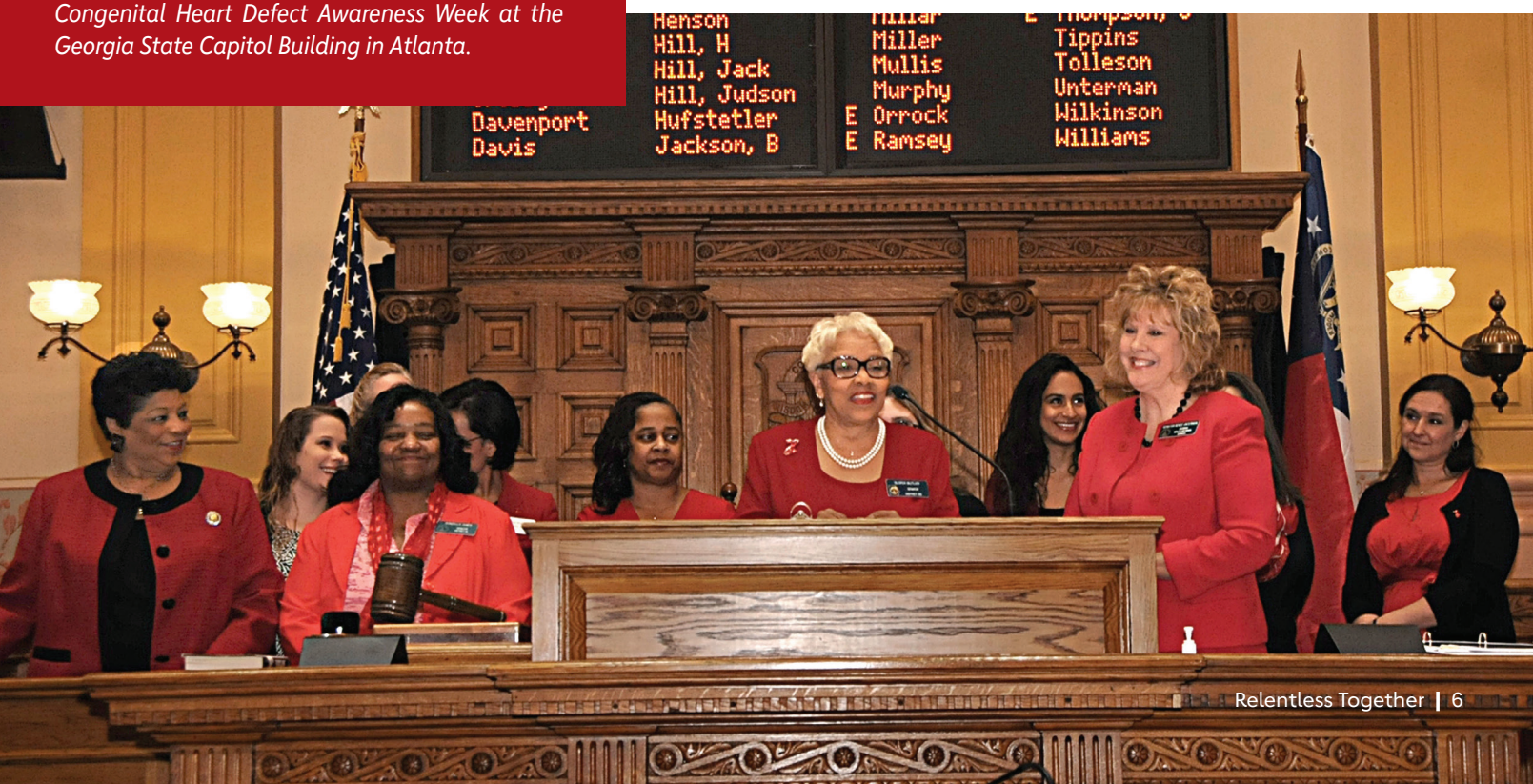
Local lawmakers and AHA advocates proclaim Congenital Heart Defect Awareness Week at the Georgia State Capitol Building in Atlanta.

Visit heart.org/advocacy to get involved now