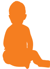
NEONATE <1 yr old & ≥24 hrs old