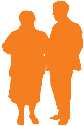
ADULT ≥18 yrs old