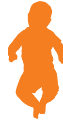
NEWLY BORN <24 hrs old

Confirmation of Airway Device Placement in Trachea (AHARES4) ↓ Time to First Shock ≤2 minutes for VF/Pulseless VT First Documented Rhythm (AHARES1) ↓ Time to IV/IO Epinephrine ≤5 minutes for Asystole or PEA (AHARES2) ↓ Percent of Pulseless Cardiac Events Monitored or Witnessed (AHARES3)